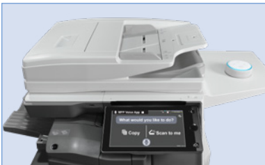
MX-M4071 shown with available Sharp MFP Voice feature with Alexa.