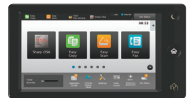
Award-winning 10.1" (diagonal) customizable touchscreen display.