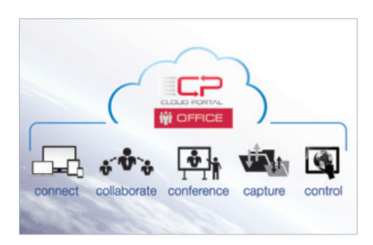
Work more efficiently and collaborate more easily with Cloud Portal Office.

A flexible design from paper handling to networking – the MX-M654N and MX-M754N monochrome workgroup document systems will exceed your expectations.