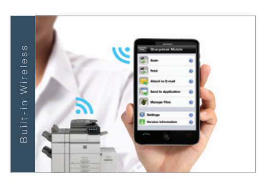
Built-in wireless network interface offers a point-to-point mode for convenient scanning and printing from mobile devices.