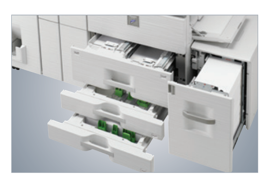
Available paper capacity stores up to 6,700 sheets.